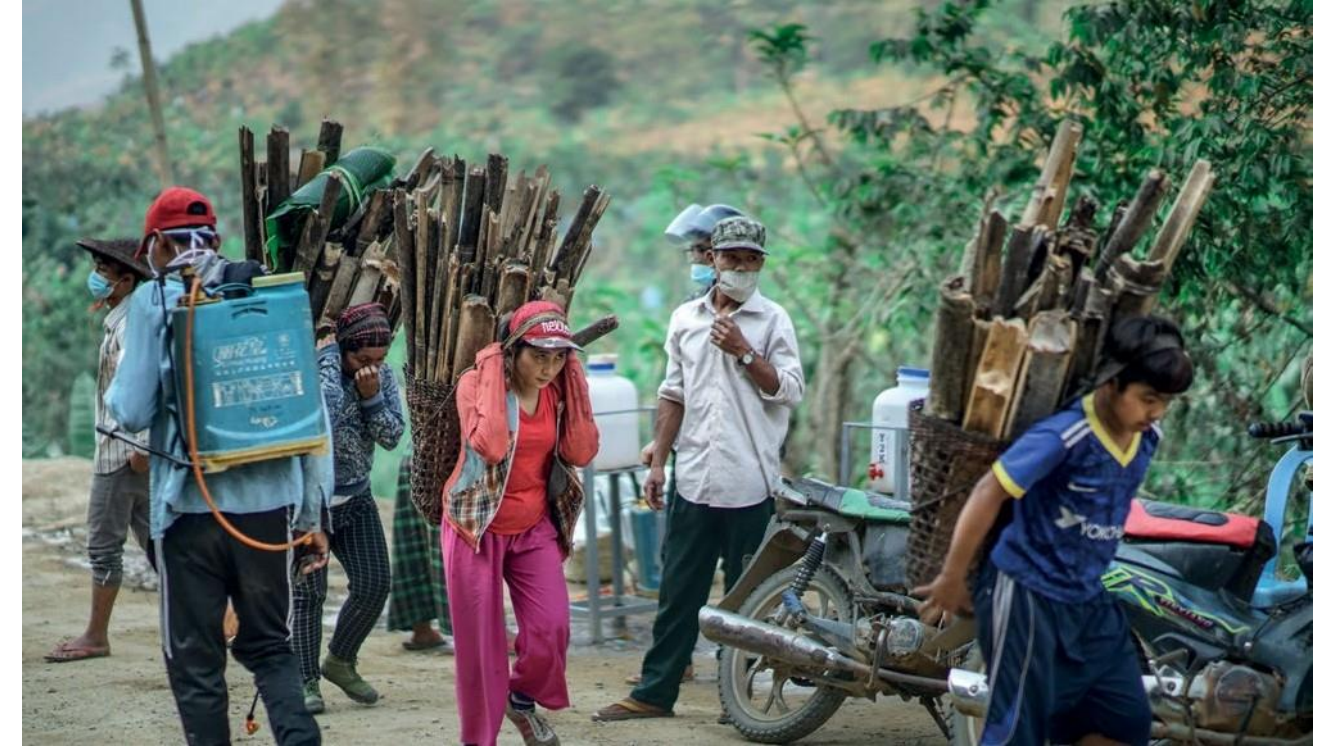
IDPs pass through COVID prevention post set up in the Ja Yang Camp.

different team members involved. The complex transition planning process as well as changing over of financial control placed a large workload on those involved from both organisations<sup>25</sup>. This also had an impact on the interpersonal relationships among key staff between organisations. Established personal relationships, and the experience in working with each other for a number of years enabled them to work through these challenges.