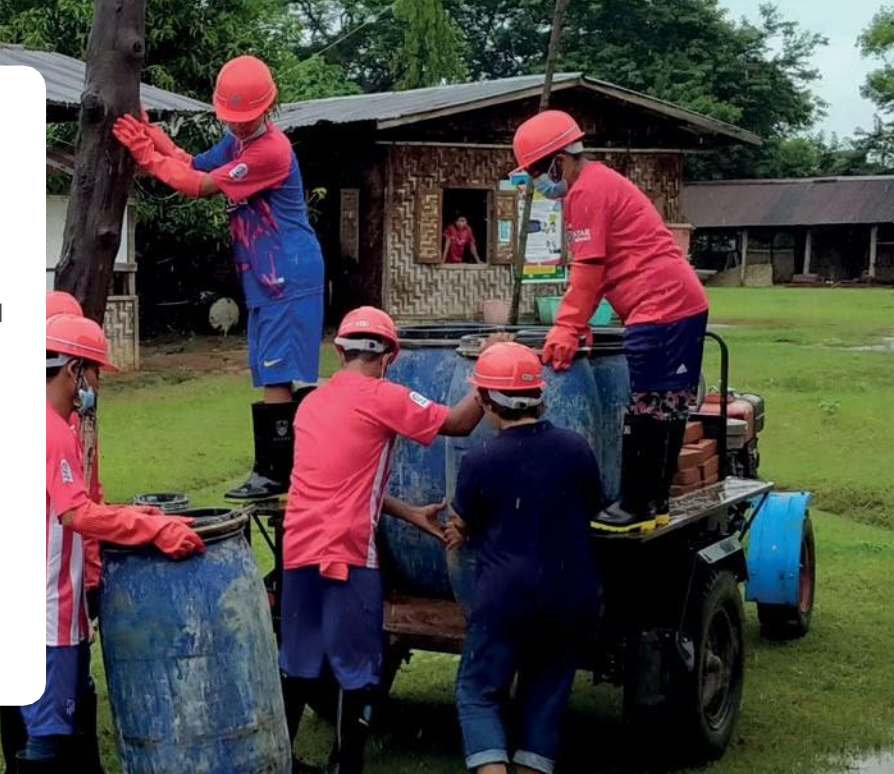
De-sludging training taking place in Bhamo (July 2020).