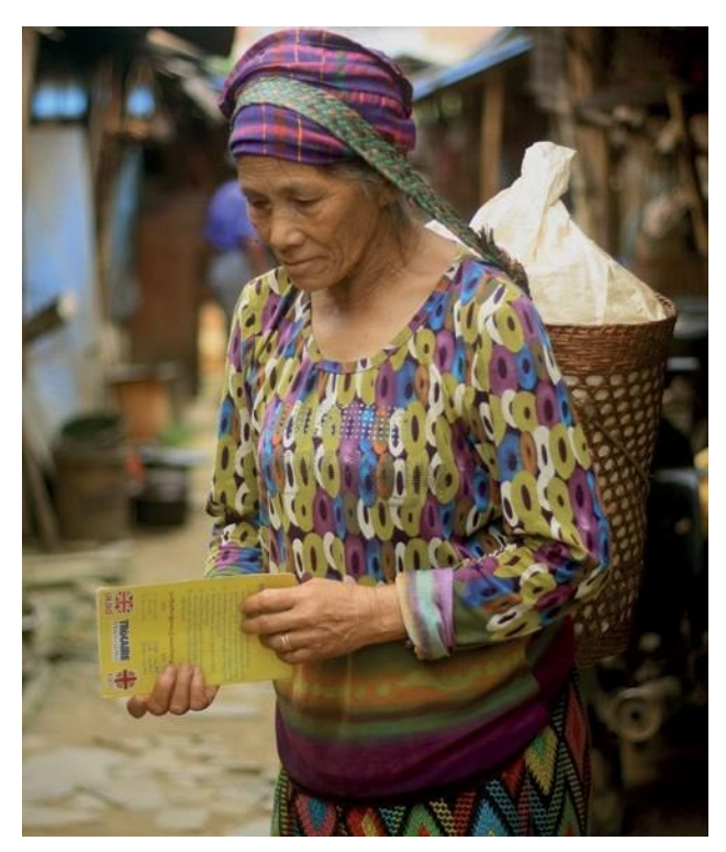
Elderly IDP, who relies on food and cash support received from Trócaire and KMSS through HARP-F funding as she lives in the Lana Zup Ja camp.

The UK government established the Humanitarian Assistance and Resilience Programme (HARP) in response to commitments made under the Grand Bargain. In designing HARP, DFID took a different approach to humanitarian assistance in Myanmar, including an explicit focus on localisation. Under the HARP Facility (HARP-F), a significant proportion of grantees are local organisations; these partners receive tailored support focused on capacity-building and organizational development, in line with Grand Bargain commitments and the principles of localisation. HARP-F directly funds Trócaire and KMSS under this localisation project.