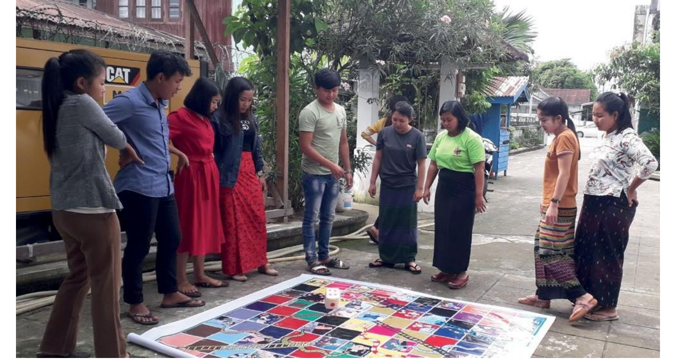
KMSS staff take part in activities during a 3 day strategy workshop organised by Trócaire WASH Advisor in September 2019.