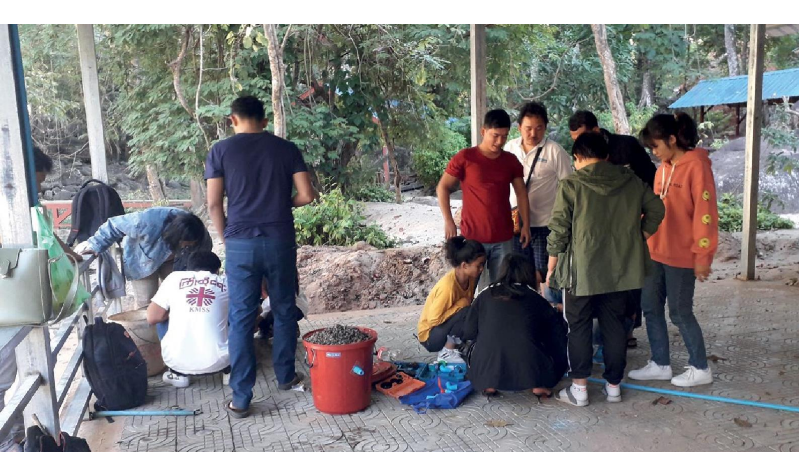
Training on household water treatment processes taking place in Bhamo during December. 2019.

"Whateverthedisagreement, we always tried to reconcile. We are part of the Caritas family, we are part of the church, so we can't say no to each other"<sup>20</sup>